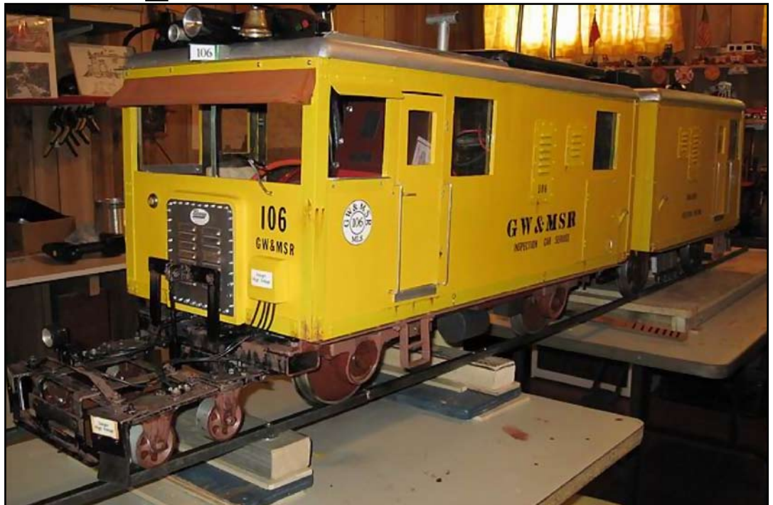
Wayne Clifford decided to model MOW equipment including this Edwards Motor Car

"The biggest piece is a rail inspection motor car with self propelled detector car combining the features of many branch line motor cars of the 1920's era. I have named this an Edwards motor car as they built many unusual motor cars before and after the war, 1921 - 1960 and they are still in business today setting up and refurbishing antique rail cars using big block chevy V-8's," explains Clifford. "I will be sitting on this motor car controlling three DC voltages 6, 12 & 24 producing three speeds. Around my neck will be a radio control unit operat-