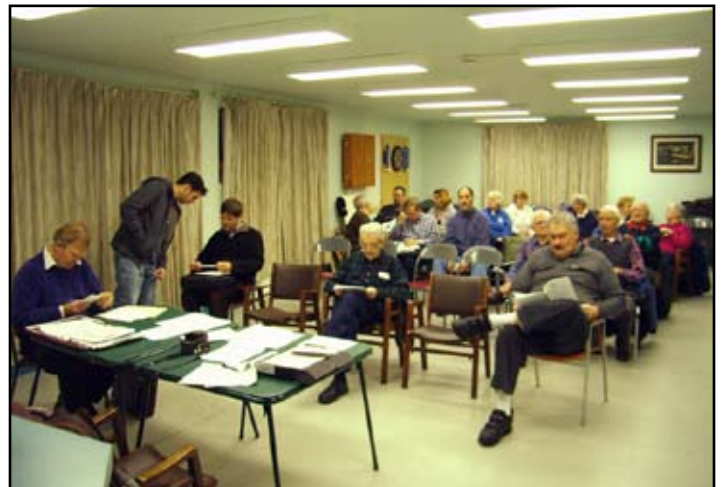
A view of the 1st regularly scheduled monthly business meeting